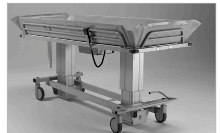
Tilting for "Trendelenburg" position and easy drainage.