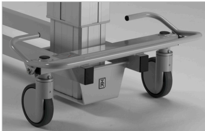
Convenient single foot control for straight steering and brakes.

The trolley is made of durable material, powder coated steel, zinc plated steel that make cleaning simple and efficient. The mattress is easily removable.