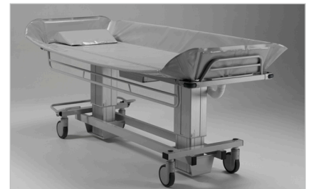
Side rails swing down or lock in horizontal position for transfer and up position for safe transport.

The side rails keep the person safely in place. Side rails swing down for transfer and lock into up position for person security and a secure transport. The trolley has central foot operated castor brakes and straight steering. The stretcher has two positions, flat for transfer and tilt for transport, shower and improved drainage. TR 4200 is delivered with mattress, high capacity rechargeable batteries, hand control, drain plug and hose.