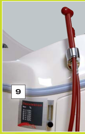
9 The GK-Relax is available with an electronically controlled disinfection system. This allows the amount of disinfectant to be adjusted to the required level.

The hydro-massage system is a fully adjustable patented 2 jet system. It is self emptying and can be disinfected.